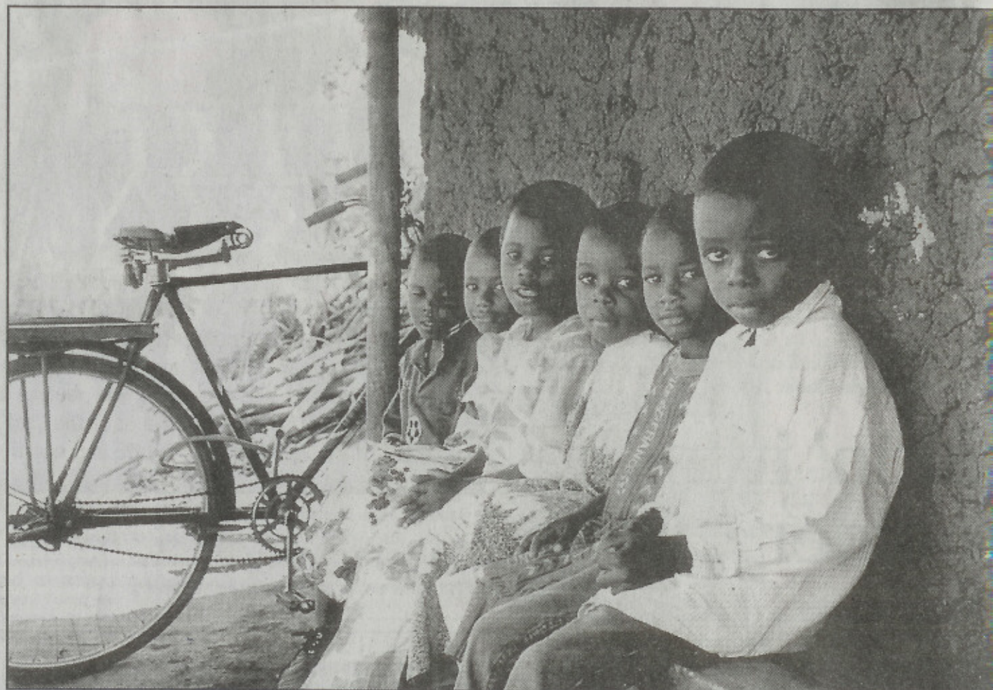
A group of children sit on a bench this summer at the Kyangwali Refugee Settlement in Uganda. A bicycle — a rarity here — stands in the background.

Three years later, Glustrom totes a cloth shopping bag heavy with videos, photos and brochures down Pearl Street. He's promoting Educate. His goal: to raise $5,000 by fall.