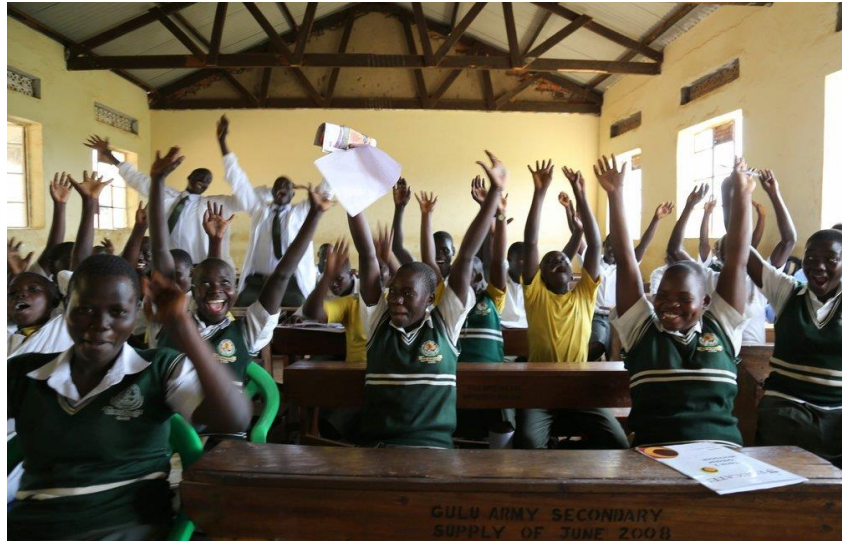
Educate! Scholars at Gulu Army Secondary School in Northern Uganda

our model has an outsized impact for vulnerable populations (like young women) who need it the most. In addition to our deep conviction that in order to best serve the youth of Uganda we needed to expand to the North, we were eager to stress test our model within the constraints of this environment. We knew that if we could innovate and adapt our model to deliver an equal quality program at the same cost to overcome the obstacles of Northern Uganda, we would be well prepared to expand throughout Uganda and internationally in Africa.