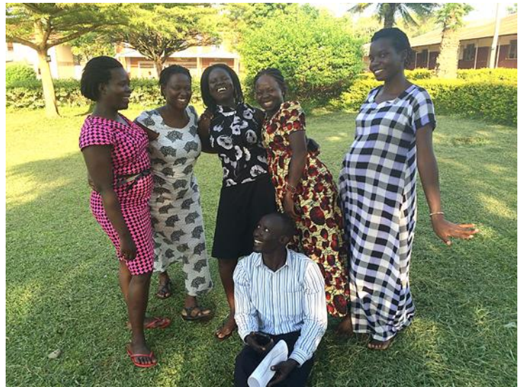
Educate!'s team in the North

Educate!'s successful expansion to Northern Uganda depended on people who are from the region and passionate about working within their communities. We invested heavily in hiring the strongest possible team from the start to lead our expansion to Northern Uganda, and ensured that they were all from the region.